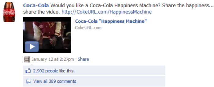
Exhibit 1 Facebook Message Announcing the “Happiness Machine”